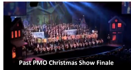
Past PMO Christmas Show Finale

Performance time and details are not yet available. Check PMO's website for more information: https://www.purdue.edu/pmo/christmas-show/