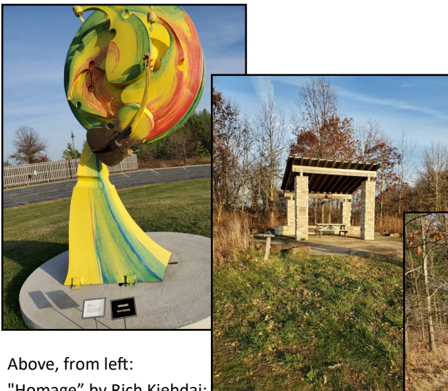
Above, from left: "Homage" by Rich Kiebdaj; a beautiful, quiet and restful setting for a picnic; one of the trails; and main building with restrooms and entrance to the Depot and Railway Garden.

The Arboretum consists of various gardens. The Native